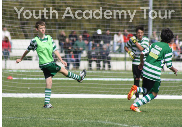
Youth Academy Tour